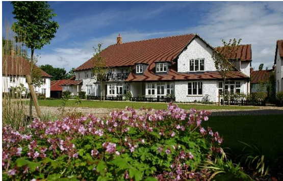
Retirement Housing Scheme in Letchworth Hertfordshire (Beechcroft)

Other mechanisms that can be employed to encourage older person's housing include specifying sites for development in "amenity rich" sustainable locations (including sites in the local authority's ownership) to meet the needs of older person households. With appropriate phasing, this can include Sustainable Urban Extensions and regeneration areas.