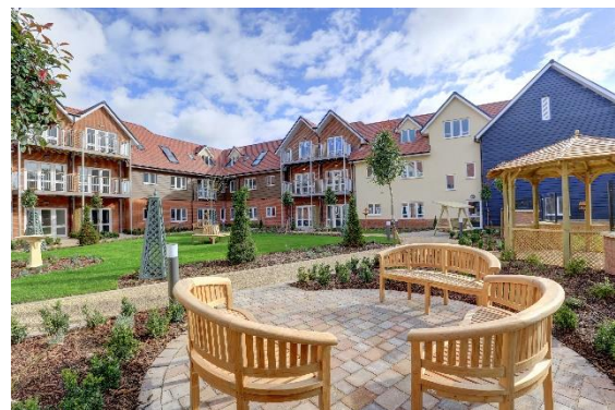
Retirement housing scheme in Fleet (Anchor)

There is a range of retirement housing designed and managed to meet the housing and support needs of older people. Typical types include Sheltered, Assisted Living/Extra Care and Close Care. Accommodation is self-contained (unlike in care homes), restricted to people over a specified age and usually provides communal facilities and support services.