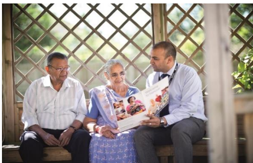
Danbury Gardens, Leicester, Extra Care scheme (Hanover)

They also promote the benefits of a range of supported housing (“sheltered, step down and extracare” xi ) in enabling independent living and relieving pressure on the care system.