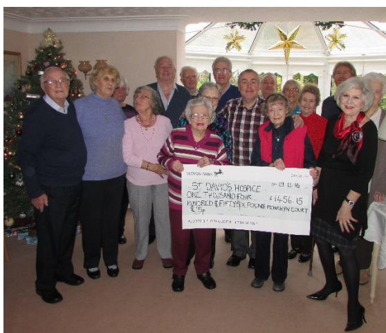
Residents at Penryn Court Llandudno

This type of model “can provide a more accessible route for people to connect to opportunities to find social connections, activities and support... Adding local transport to the picture to support connectivity, this is a model that could be flexible to rural and urban areas, based on community or service based geographies” xxvi .